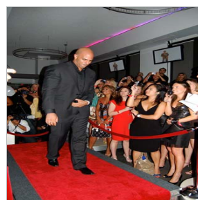
As the models—"D.C.'s eligible bachelors," according to the program—took the runway, most of the 300 guests crowded around and whipped out cameras.